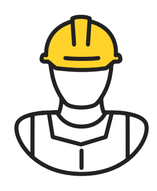
Construction companies are using tech to more quickly address safety issues.

In recent years, the rate of safety violations and worker deaths has increased dramatically in the construction industry, partly due to the increased demand for speed (and in some cases, companies cutting corners to meet mounting competitive costs). In 2016, according to the latest data from the Bureau of Labor and Statistics, construction industry deaths rose 5 percent with 1,034 worker deaths.