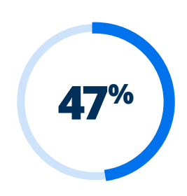
By using Smartsheet, 47 percent of users report saving at least six hours every week.<sup>1</sup>

Improve Workflow. Construction projects typically go through a series of phases before completion. Timing of these phases can vary, from steps that need to be finished before another can start, to steps that must start and finish at the same time. At any point during a workflow, a bottleneck can occur when people are waiting for information or an approval. This presents a valuable opportunity to use technology to expedite processes and save time. By using Smartsheet, 47 percent of users in the construction industry report saving at least six hours every week.<sup>1</sup>