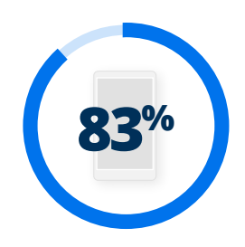
83 percent of respondents said that mobile technology was either very important or important to their construction business.

More construction professionals are now using mobile technology to provide real-time communication that vastly cuts down on this type of inefficiency. According to the JB Knowledge 2017 Construction Technology report, 83 percent of respondents said that mobile technology was either very important or important to their construction business.